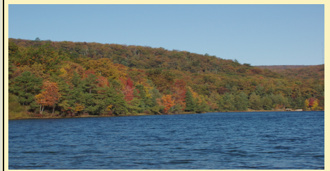
Long Pine Run Reservoir