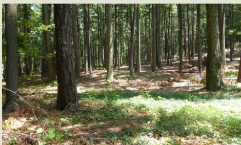
Meeting of the Pines Natural Area