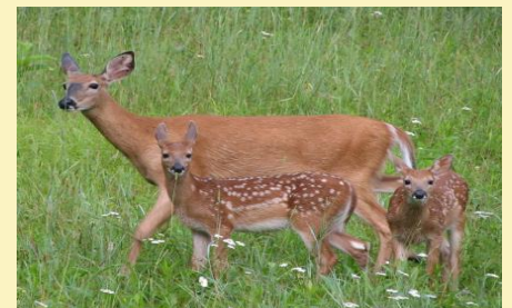
White-tailed deer are plentiful throughout the state forest.