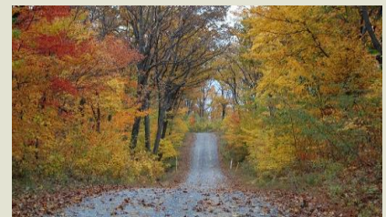
Colorful fall foliage peaks in October.